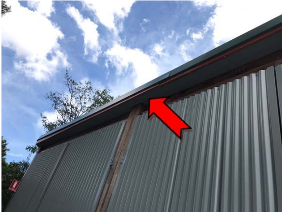
Photo Exterior, throughout, eaves – suspected 1. asbestos-containing fibre cement sheeting.